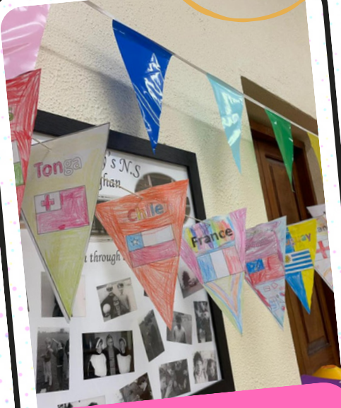
Rugby World Cup

The boys and girls have created a fantastic banner of all the flags of each country taking part in the Rugby World Cup. They have even designed their very own rugby jerseys! Well done everyone!